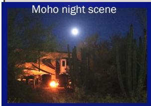
Moho night scene