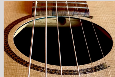
Guitar neck rod