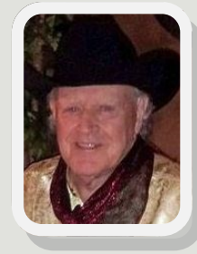
- The Balladeer